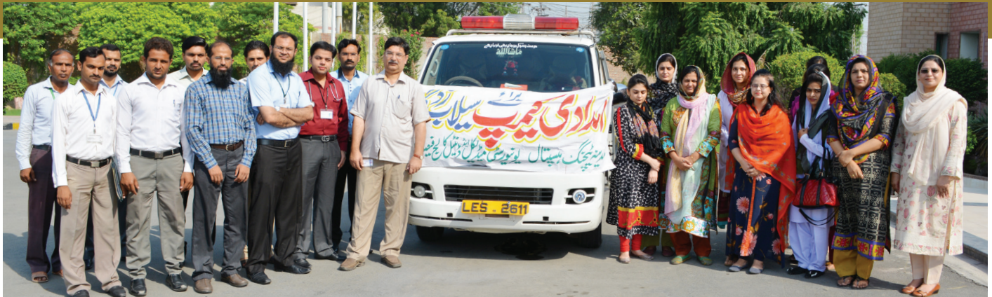
A team of doctors and paramedics from UMDC & MTH, along with medicines and food items departing to set up medical and relief camps in flood affected villages of District Chiniot

Under the auspices of Madinah Foundation, The University of Faisalabad is working actively in engaging community members endeavor for society's wellbeing and empowering the youth with utilitarian skills. TUF stands out as an emblem of organized philanthropy. In this context The University of Faisalabad, University Medical and Dental College and its affiliated Madinah Teaching Hospital organized series of free medical &